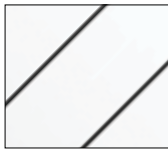
White RAL 9016