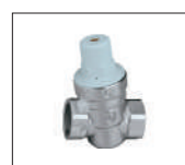
Pressure Reducing Valve 0.60 Mpa