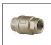
Check Valve 0.35 Mpa