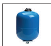
Expansion Vessel 8 L (0.1 Mpa)