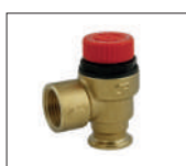
Expansion Relief Valve 15 - 25 mm